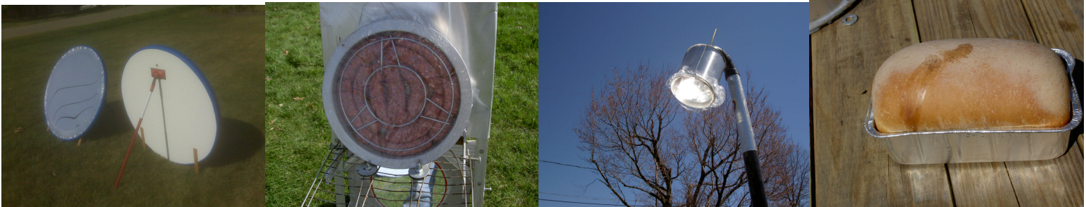
Back of Dish showing oak legs and adjustable elevation leg

Vacuum holds for ½ hour before requiring a few pumps to reestablish focal length. Note that as the sun moves, small adjustments to the dish position are required