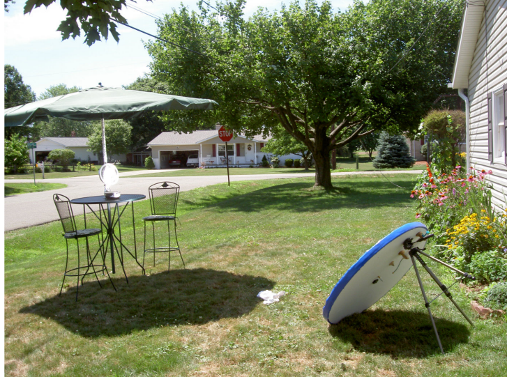
Concentrating Solar Dish focusing light on cooking pan hanging from umbrella pole. U.S Patent # 7,374,301